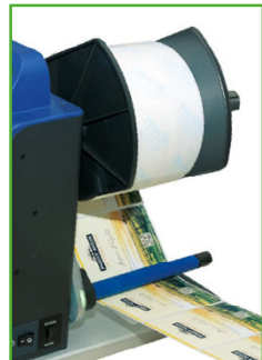
Wound In/Label Inside