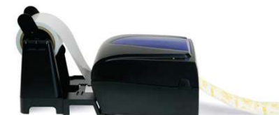
DTM UW-4 Passive Label Unwinder in combination with DTM FX510e Foil Imprinter

It's the perfect accessory if you want to increase your unwind capacity with up to 114.3 mm (4.5") wide rolls.