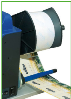
Wound In/Label Inside

The arm can hold a roll weight of up to 5 kg and with the core adaptors you're super flexible. Easily change from 1" cores (without adaptor) to 1.5", 2" or 3" cores.