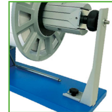
L-shaped support arm

The RW-8 Label Rewinder complements the DTM Winder Series in the upper range for up to 220 mm wide rolls. For heavy and very wide rolls an L-shaped support arm is included, which can be mounted in seconds if required.