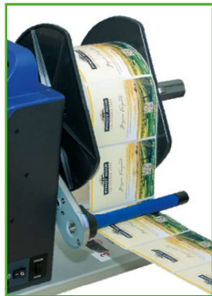
Wound Out/Label Outside